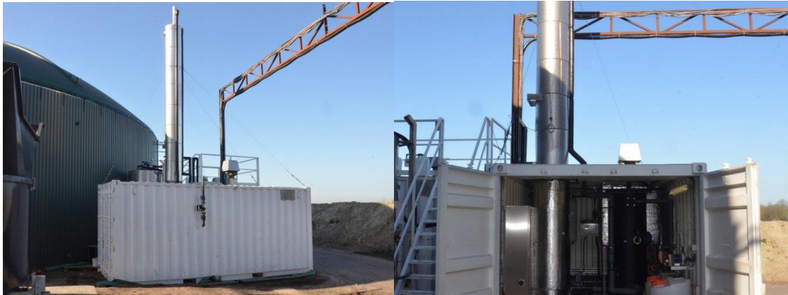
Fig. 2 Example of pilot installation in the Netherlands.

Operational expense (OPEX): EUR 50.000/year.